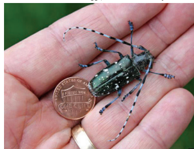
Adult Asian Longhorned Beetle.