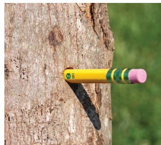
Exit hole (with pencil).