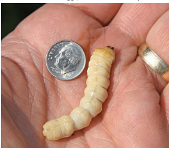
Asian Longhorned Beetle larva.