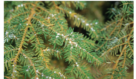
Hemlock branch infested with HWA.