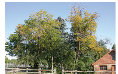
Walnut trees dying from TCD.

Ned Tisserat at Colorado State University