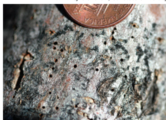
Exit holes of walnut twig beetle.