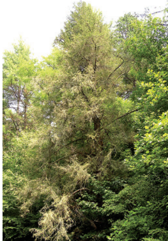
Infested hemlock tree.