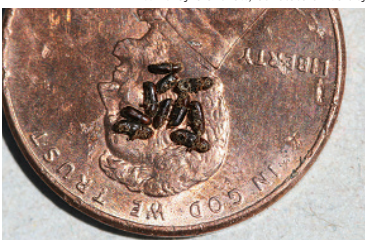
Tiny adult walnut twig beetles vector TCD.