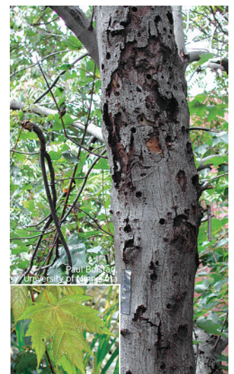
Maple tree with ALB exit holes with maple leaf insert