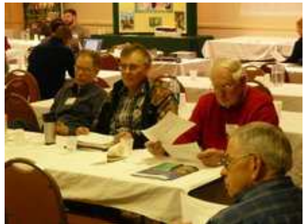
Interested audience members await the next presentation.