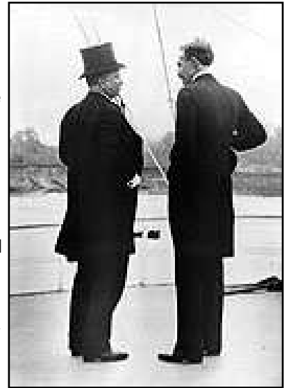
Theodore Roosevelt and Gifford Pinchot, 1907. Two great early American leaders.